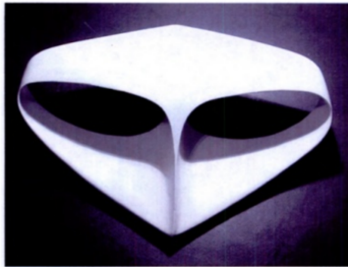
Figure 2: Evaluation Model of Houck Airfoil

Volume 2 - https://www.technicalreports.org/trail/detail/147977/